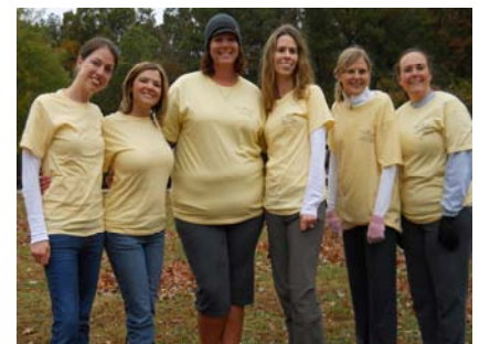
GRAC sisters posing in our new JDRF walk team t-shirts