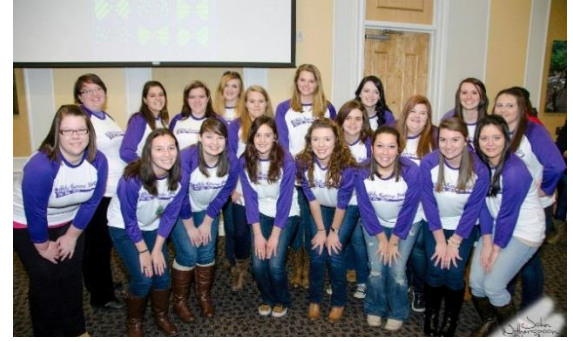
Theta Omicron - Bid Day 2014

Theta Omicron will be hosting International Reunion Day on April 26 th at 11 a.m. in the Blue Ridge Conference Room at Western Carolina University.