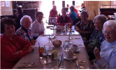
Lunch Bunch at Coquette (North Hills, Raleigh)