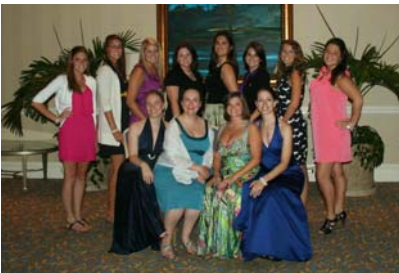
Province 34 - Convention 2010

Our International Convention will be held Wednesday, July 18, 2012 through Sunday, July 22, 2012 at the Hyatt Regency St. Louis at the Arch in St. Louis, Missouri. Alpha Gamma Delta chose "Live With Purpose" as our new brand for the fraternity and it is also the 2012 convention theme. Convention is a wonderful opportunity for Alpha Gamma Deltas to